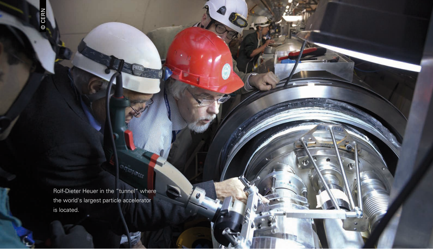
Rolf-Dieter Heuer in the "tunnel" where the world's largest particle accelerator is located.

? Your career started with the study of physics at the University of Stuttgart. What advice would you like to give to your Alma Mater for the future?